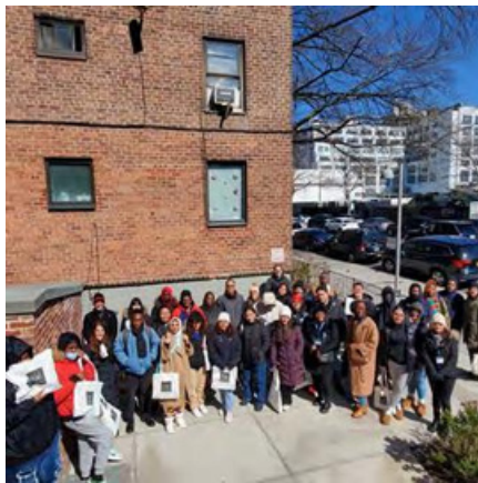
Site visit - Spring 2023