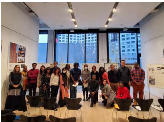
Community presentation - Fall 2022