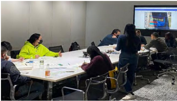
Collaborative workshop - Spring 2022